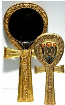
Ancient Egyptian mirror

"And he made the laver of brass, and the foot of it of brass, of the looking-glasses of the women assembling, which assembled at the door of the tabernacle of the congregation."