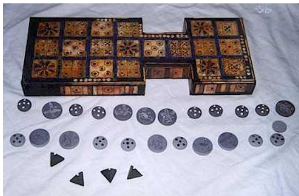
Backgammon board from Ur

http://joseph_berrigan.tripod.com/ancientbabylon/id13.html