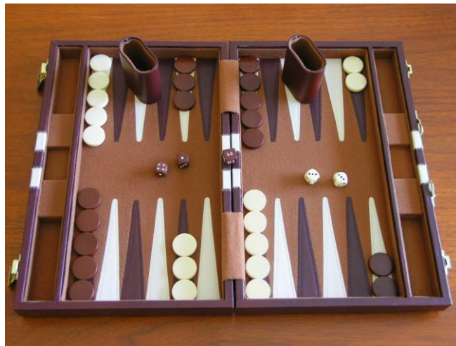
Modern Shesh-Besh (backgammon) board